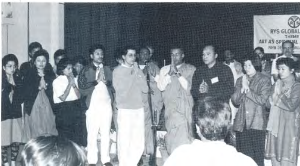
The Buddhist group offers a prayer.