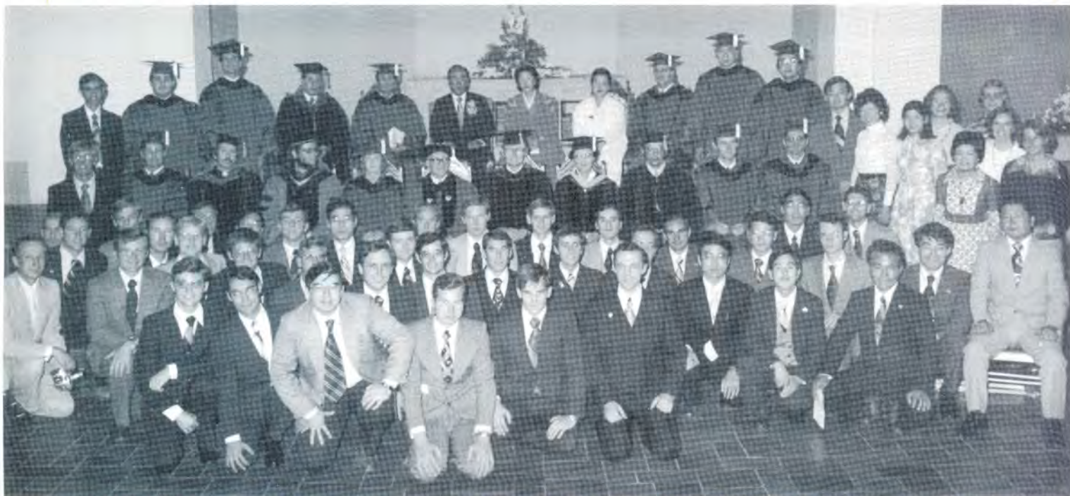
When the school was built, I drove from Tarrytown to Barrytown [two and a half hours] every day for three years in order to meet with you and speak with you. I tried to set the best possible tradition at UTS by going there and teaching every day.

I cannot stay here permanently. I have a job to do in Asia. I have to bring unification to the Korean peninsula. There are 3.2 billion people there waiting for my message. I must move on. When I move on, how many seminarians will say, "Father, leave it to us. We shall guide this nation. We shall be Rev. Sun Myung Moons here. Don't worry about the United States"? By words and promises I would like to bind you together. That's the purpose of your coming today. I would like to bind you together in a promise that UTS will initiate the "Save America" movement and take over my mission. Say, "Yes, Father, we are your direct heirs, your champions, your children. We have inherited your tradition, your methods, your truth. We will take