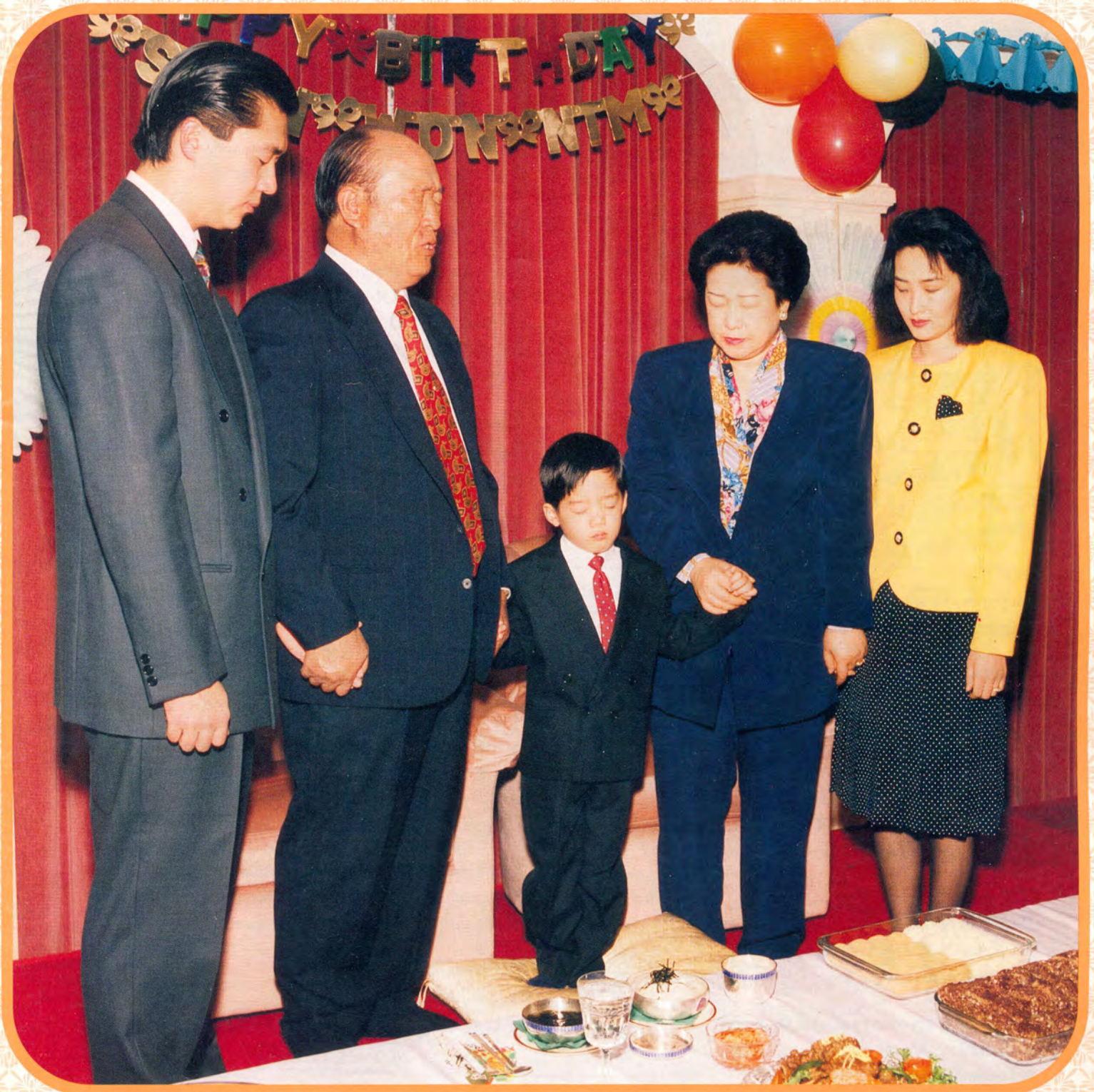
Father's Leaders' Conference with UTS Mother in China for WFWP /IRFWP India