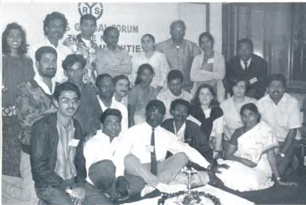
Feeling as one, the participants of the Marginalized Communities and the Religious Response workshop pause for meditation.