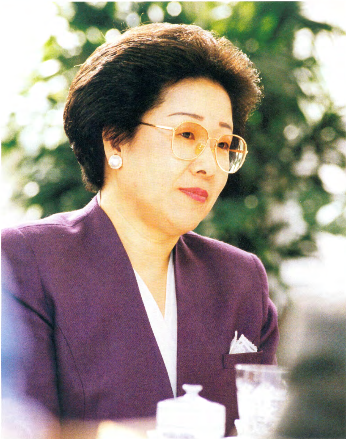
◀ Mother thoughtful level welcome luncheon in Beijing, China, December 22, 1992.