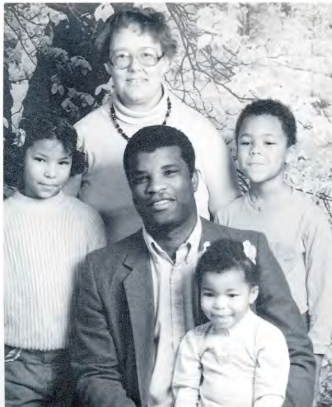
A Coman family portrait.

A Seung Hwa ceremony can be a very beautiful experience. It truly is a time for celebration as that individual is able to move on to a new level in his or her life of faith and relationship with God and True Parents, one that we may only truly understand when our time comes. The more preparation done both spiritually, through our relationships with others, and externally, through making sure we have the proper things prepared, the