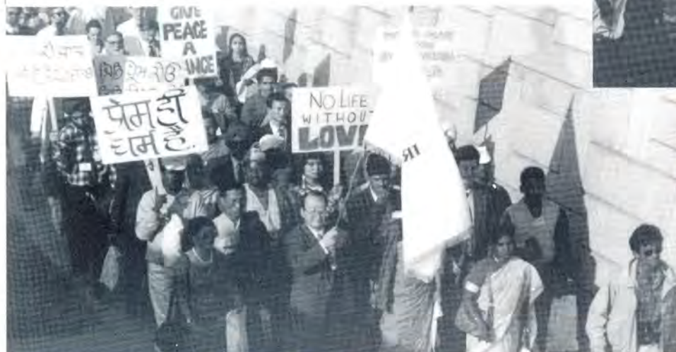
This peace march will mark the rebirth of Indian nationhood, and the beginning of a new century of interfaith harmony.

It is the will of God, and the desire of the universe, that all women and men live in peace and have authentic sacrificial love toward one another regardless of ANY difference including difference of religion.