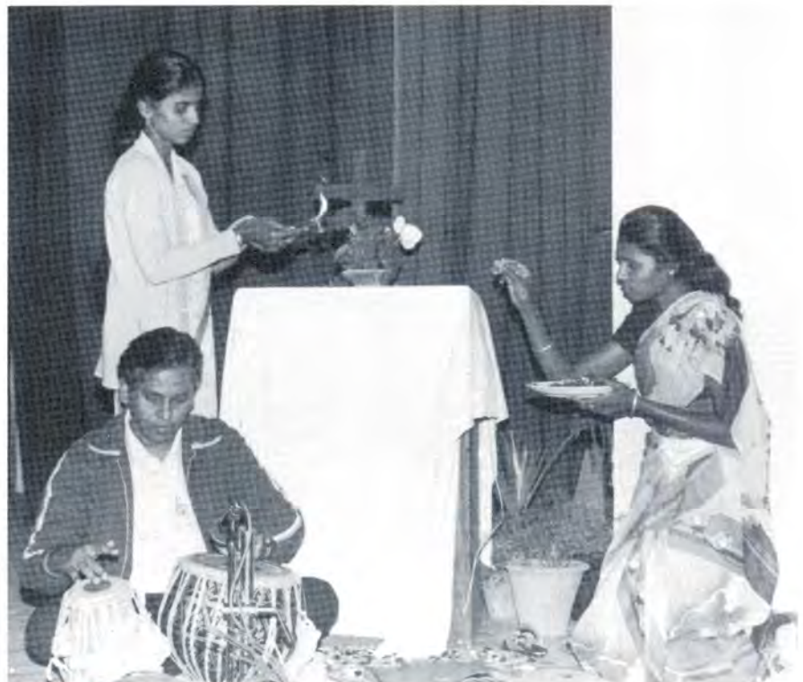
Left: In this skit "Mother India" is uniting all her different peoples.