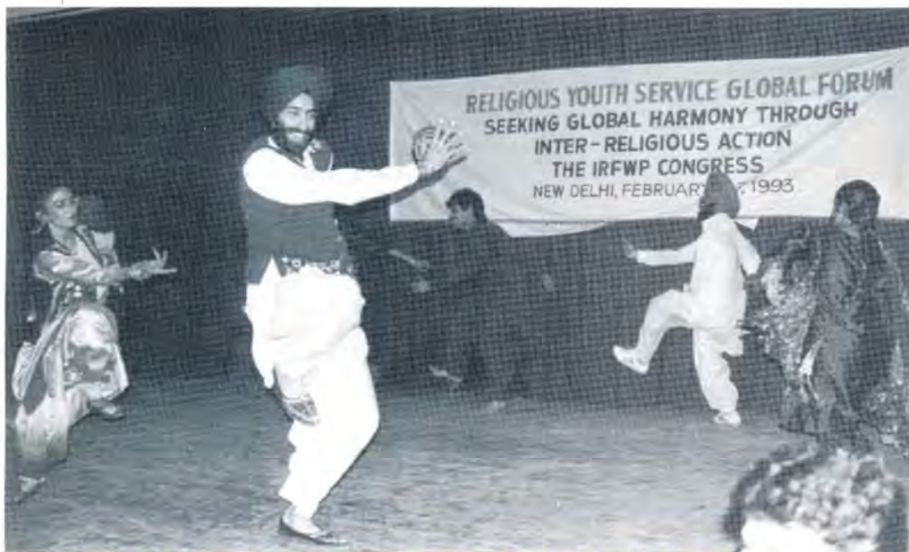
Some of our newly-blessed Indian couples join in this Sikh folk dance.