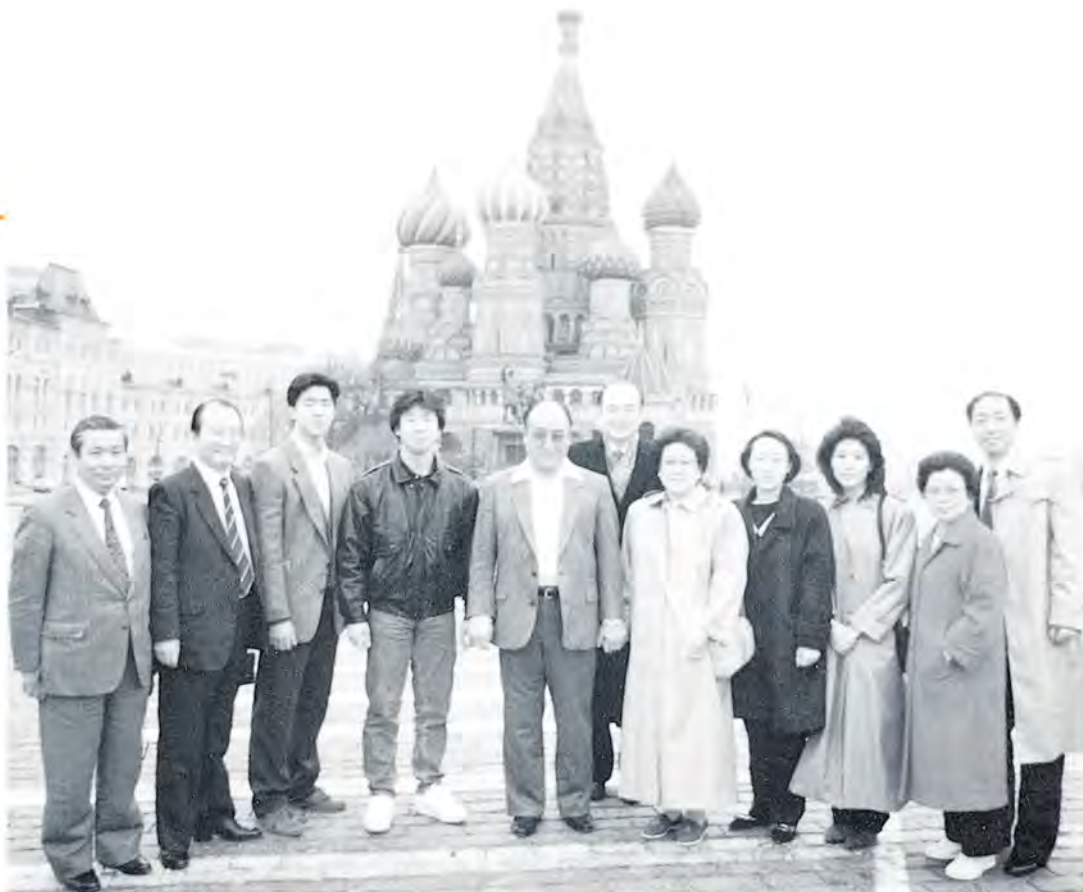
After Danbury great things happened. I went to the Soviet Union, the center of the communist empire, and was welcomed into the Kremlin by Gorbachev.

You see me here, such a short distance from you, in a very intimate way. However, you have no idea what I have been doing during this time. Many things are going on in my heart, in my mind, and in my actions. If you don't know what I am doing now, you are even less aware of what is happening spiritually. So much has been happening spiritually that you have no way of knowing about it. I originally asked how much you know me; it is not an exaggeration to say that you know me