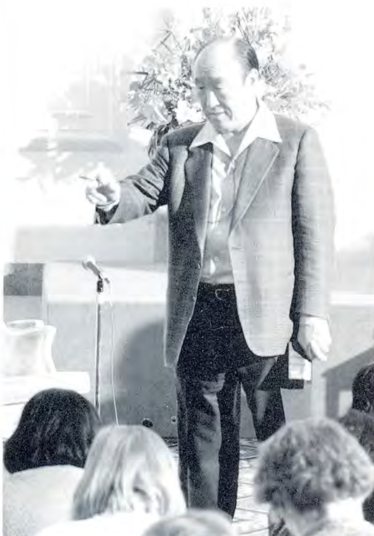
Open the door for the era of great evangelical meetings for the young generation.

teaching at the beginning of my ministry, people would have accused me of trying to amass wealth. However, this is something I have to teach you, and now is the time. Nobody else is qualified to proclaim this principle. Communism was born because Satan knew that the time of transferring all things into the ownership of God was approaching. Under communism the state took control of property at gunpoint. However, the communistic scheme didn't work at all. In contrast, I am talking about voluntary offering. This hair doesn't really belong to you; even your head doesn't belong to you. Right now it belongs to Satan, so you have to transfer ownership to heaven.